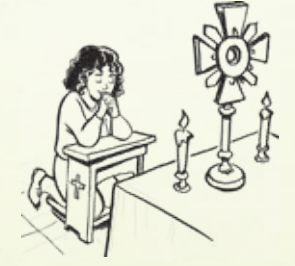
A holy person prays in silence.