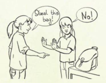
A holy person does not give in to peer pressure.