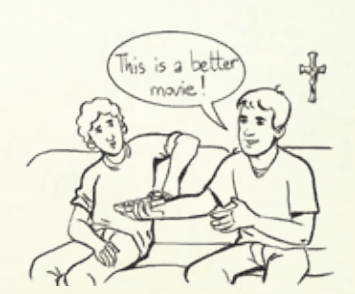
A holy person is careful of what he watches.

Look at these images to see what kinds of things a saintly person does.