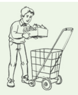
A just person gives back to his community and country.