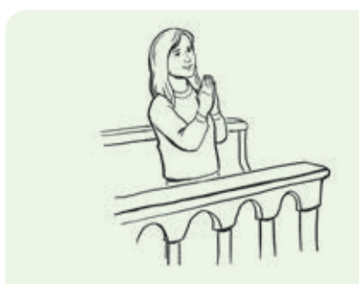
A just person gives what is due to God.

It would be unjust to prioritize sports, family, or friends over God. For example, let's say you had a sports game on Sunday. You do have an obligation to your team, but you also have an obligation to God. In justice, our obligation is to God first. So, it would be unjust to skip Mass in order to play the game. We are not giving God what is due to Him.