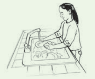
A just person helps her family with chores.