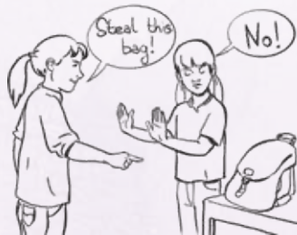
A holy person does not give in to peer pressure.