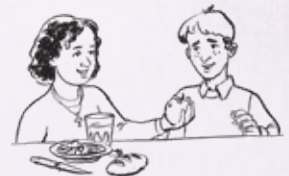
A holy person shares with others.