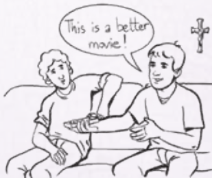
A holy person is careful of what he watches.

Look at these images to see what kinds of things a saintly person does.